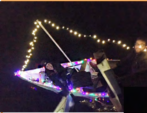
The annual Holiday Boat Parade circumnavigated Lake Howell Dec. 9 to the delight of dozens of revelers on the dock.