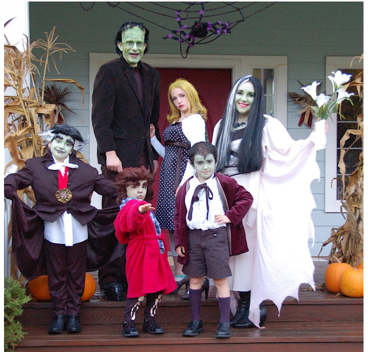
Put on your own spooky fashion show (and enter the Sausalito Shores costume contest) to liven up Halloween this year.

2. Learn a Halloween dance. This could be the big finale for your home video or play – or just a great way to get some exercise and laugh together as a family. Search YouTube for “monster mash dance,”