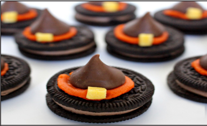
Get creative with your kids with creepy treats at home this year!

4. Make Halloween treats. From cookies frosted to look like witch hats to tangerines peeled and garnished with mint to look like pumpkins, the options are endless. Whatever you decide, you'll be spending time with your child building kitchen skills and having fun.