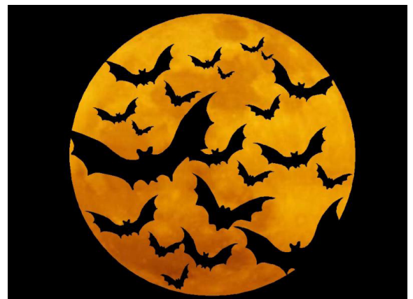
Feeling adventurous? Camp out under the full moon on Halloween weekend.

It's also a “blue moon,” aka the second full moon of the month. So set up a tent, and enjoy the show. Howl if you want to.